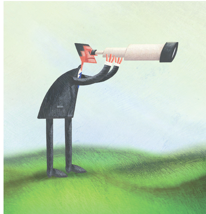
EMA works diligently to stay abreast of market trends, the competition and demands for talent.